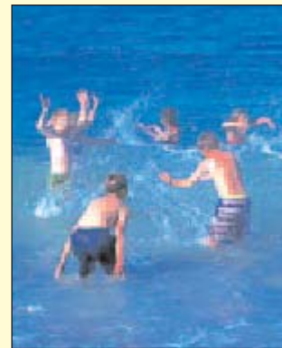
Photo: Gyllyngvase Beach

Front cover photo: Chapel Porth