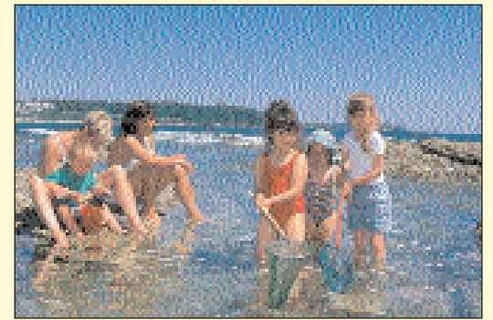
Photo: Gyllyngvase Beach